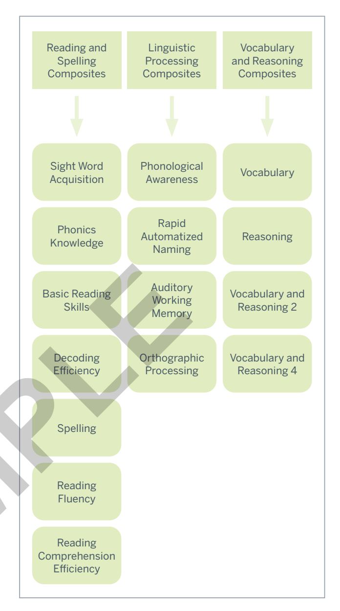
Figure 1.2. TOD-C Composites

An additional 14 tests allow for further assessment of skills related to dyslexia. The 23 total TOD-S and TOD-C tests can be combined to yield 15 additional composites (seven in the reading and spelling domain, four in the linguistic processing domain, and four in the vocabulary and reasoning domain) that provide further information about specific skills and abilities relevant to dyslexia (Figure 1.2).